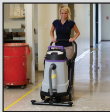
Extreme Weather Condition