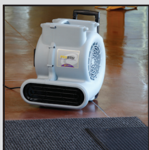
Entryway / Walk Off Mat