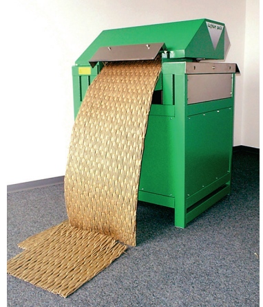
flat padding mats