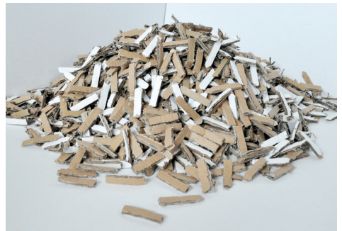
pourable chips 8x40-200mm