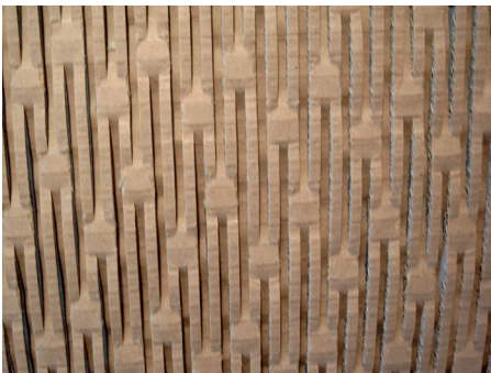
flat padding mats