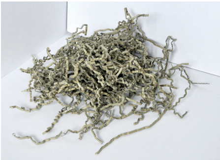
stripes 4mm DIN66399/1-2

Give your waste cardboard a second life!