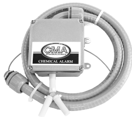
Low Chemical Alarm